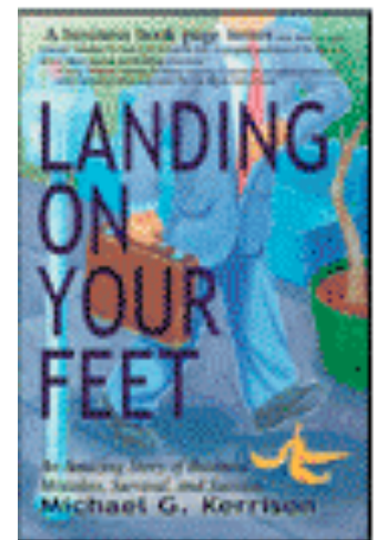
Landing On Your Feet A Story of Business Mistakes, Survival and Mistakes